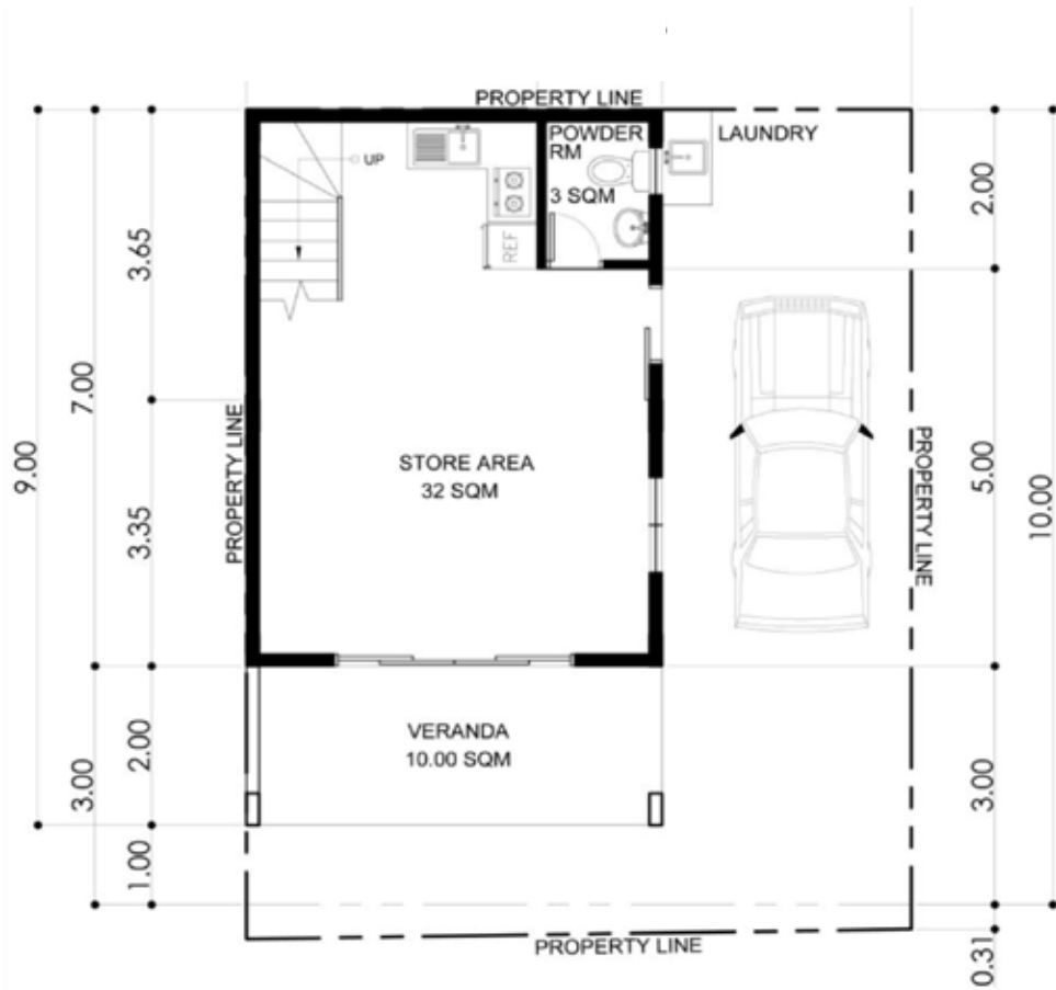
GROUND FLOOR PLAN 45 SQM