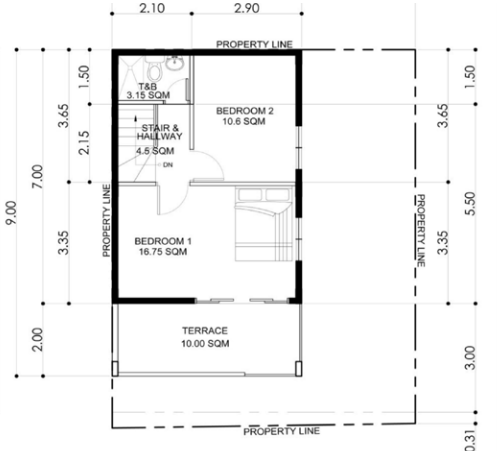
SECOND FLOOR PLAN 45 SQM